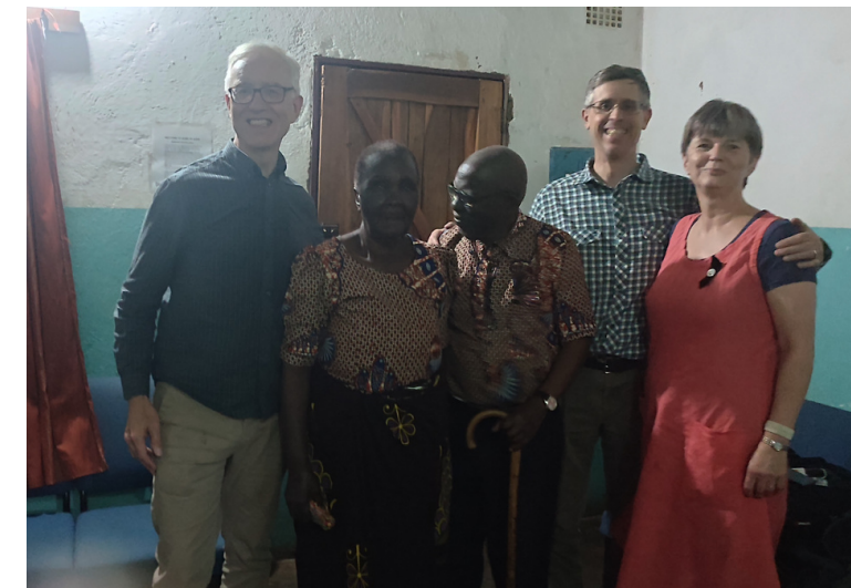
An evening with the Chipetas