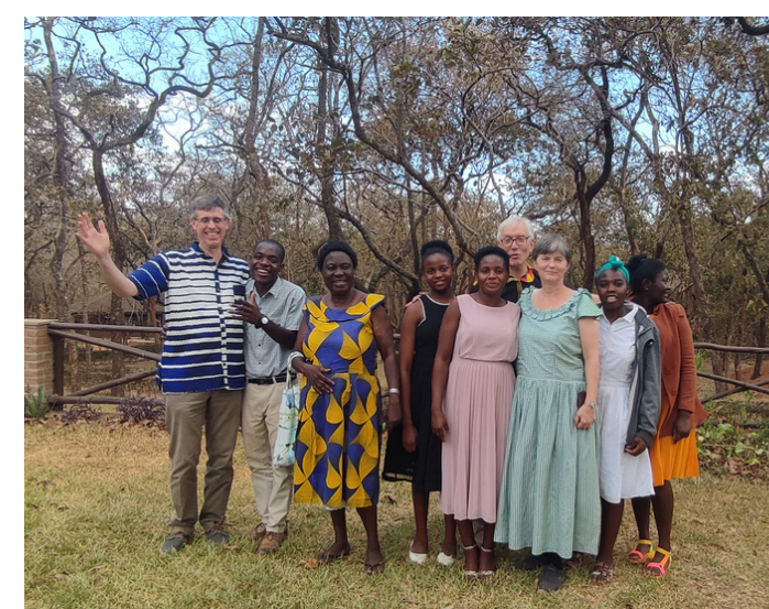
Meeting graduates in Lilongwe