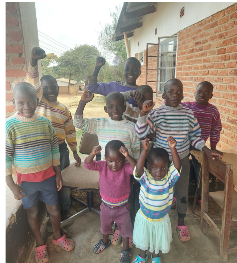
Smiles all round

One key focus of the trip was to learn about the progress and needs at the Home's schools. The team met staff from each of the Vocational Training College (VTC) and Secondary and Primary schools. A fantastic encouragement was shared: in 2020, Home of Hope's Primary School student attainment was the highest among the 15 government Primary Schools in the local area: of 44 Standard 8 learners (nominally 13-year olds, though in Malawi as in some other countries students are "held back" if they don't pass end-of year assessments), almost all gained places at government Secondary Schools. A priority for the VTC at the moment is housing – more (ten in total) are needed in order for the Government to provide more teachers. Each semi-detached pair cost $20,000 to build. One is progressing after a recent donation from the UK in response to the Chipetas' 70th Wedding Anniversary fundraising drive!