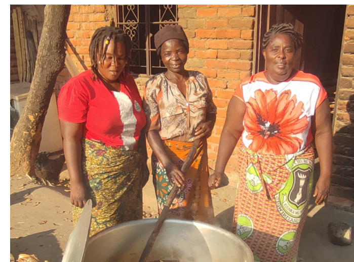
Preparing for the party