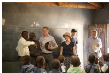
Meeting a teacher for the Secondary School at HoH in a Standard 1 class

We in Malawi Orphan Fund certainly believe it is our responsibility to look ahead. While it may be necessary to come to you from time to time with news of an unforeseen disaster, asking for help, our desire is to support Home of Hope in becoming more and more resilient to stress. It should be no surprise to us that for now, in Africa, trouble comes!