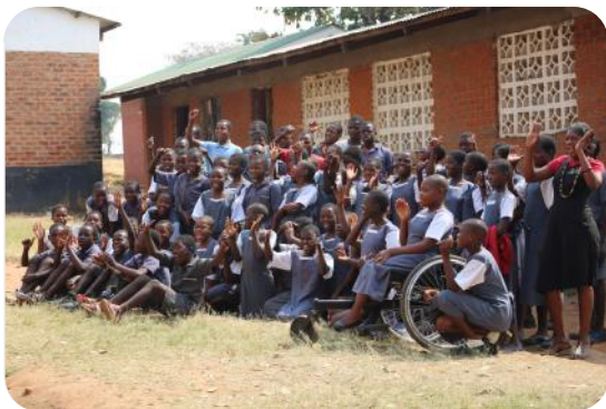
Photograph of a class at the Home of Hope

We look forward to more fundraising taking place in the near future. Please let us know if you would like any information on this.