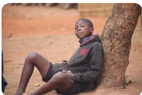
Waiting for official school photos