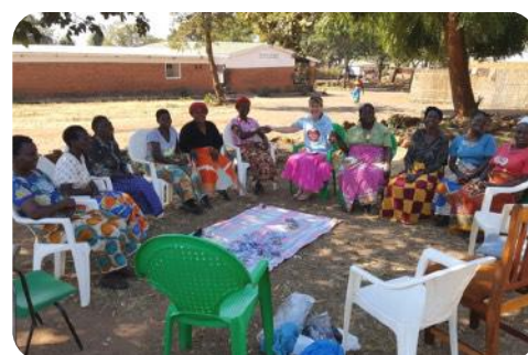
Spending time with the House Mothers

Sign up for our newsletters straight to your inbox by visiting malawiorphanfund.uk and fill out the form or send us an e-mail.