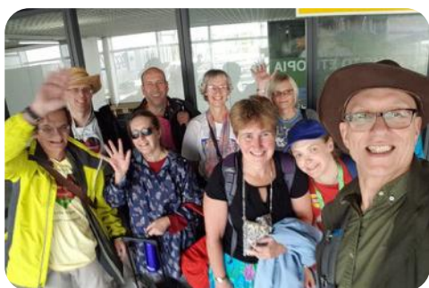
The Group On their way to Malawi

Below you will see a number of the projects they completed. This included the playground which has been a complete success. This is down to our wonderful supporters who donated funds which were spent on the playground, and other projects to help the kids relax, play and learn whilst at Home of Hope. The team themselves raised over £2000 which went towards the projects they completed.