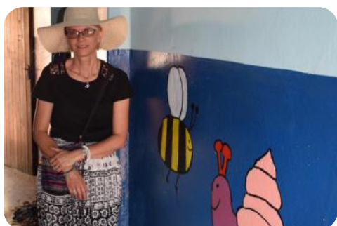
Painting murals inside the buildings

The playground, built by local craftsmen & the group. Funded by M.O.F Supporters