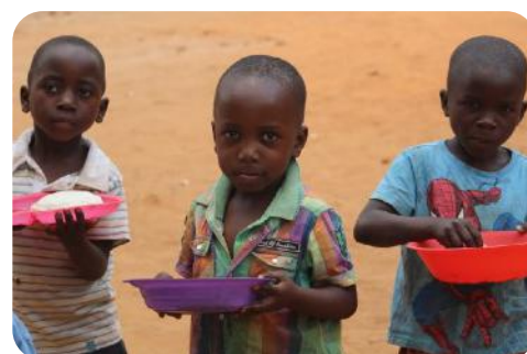
Children receiving their lunch - nsima and beans