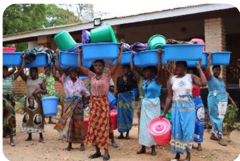
House mothers with new buckets and basins